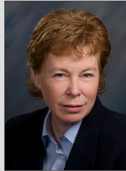
MESSAGE FROM THE MOBIUS EXECUTIVE DIRECTOR:

Welcome to the Fall/Winter edition of News Link , your guide to developments about MOBIUS and the Common Library Platform (CLP) project. The past few months have been exciting for MOBIUS. Inside this issue you'll find a number of interesting articles including features on two of our member institutions: the University of Central Missouri and Covenant Theological Seminary. You'll also find highlights on new technologies to the Consortium Office as well as updates from a few of our committees and on the Consortium Office recent visit to UM Libraries Depository Module 2 (U2).