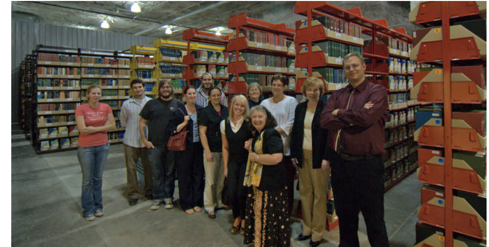
MOBIUS Consortium Office members poses with the University of Missouri Library Depository staff during their recent visit.