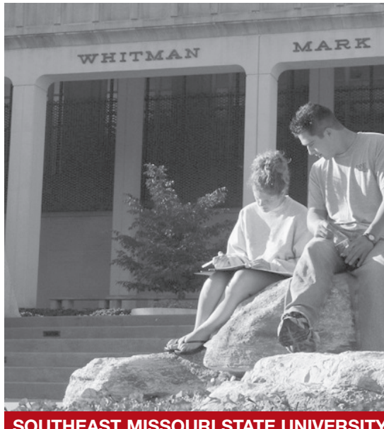
SOUTHEAST MISSOURI STATE UNIVERSITY