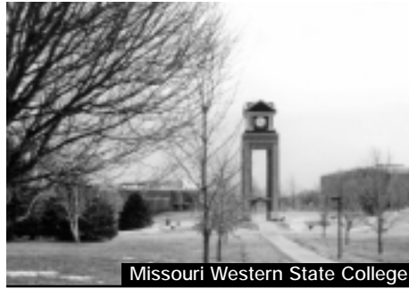
Missouri Western State College